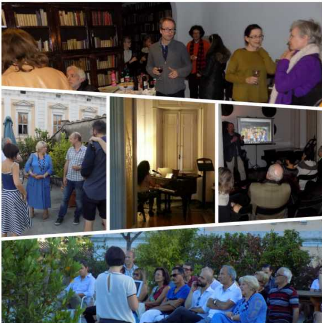
Writer | Finland